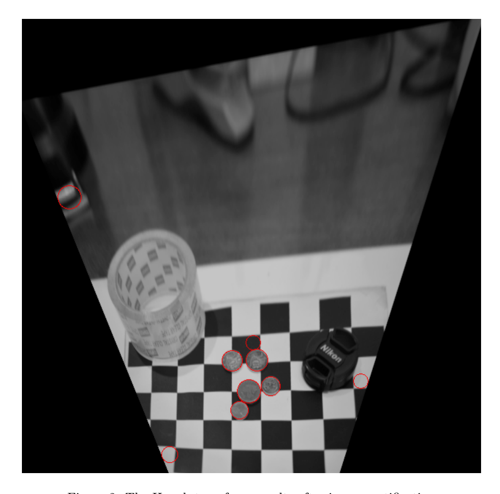
Figure 2: The Hough transform results after image rectification